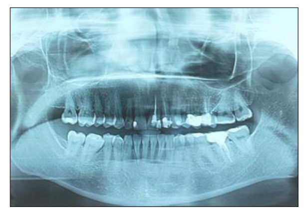
Fig. 2. Initial panoramic radiograph.