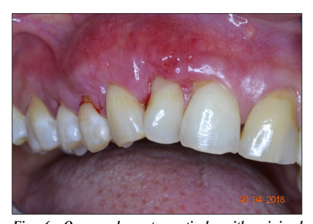
Fig. 6. One week postoperatively with minimal erythema and or oedema.

periosteal elevator. Subsequently, a precise supra-periosteal dissection was carried out using the Allen Arrowhead Knife, culminating with the Modified Orban Knife. Following these steps, the allograft was placed within the tunnel