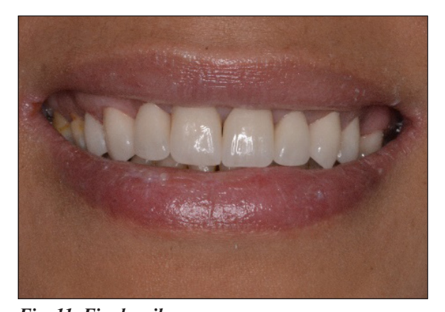
Fig. 11. Final smile.

were fabricated using CAD/CAM technique and were checked intraorally. Then the crowns were cemented with resin-modified glass ionomer cement (BioCem; NuSmile, Ltd, Houston, TX. USA) following the manufacturer's instructions. Excess cement was removed. The final restoration is shown in figures 10 and 11 (Figs. 10, 11).